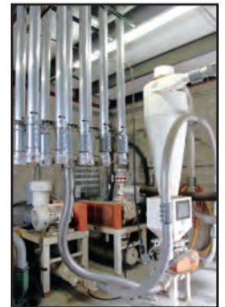
(2) BEST ENG 50 HP RAIL CAR UNLOAD SYSTEMS