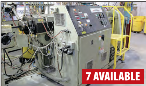
DAVIS STANDARD M-VI 25IN25 2.5" 24:1 EXTRUDER