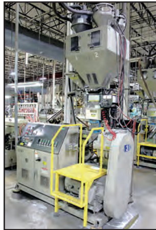
DAVIS STANDARD 2-1/2 MARK VI 2.5" 24:1 EXTRUDER