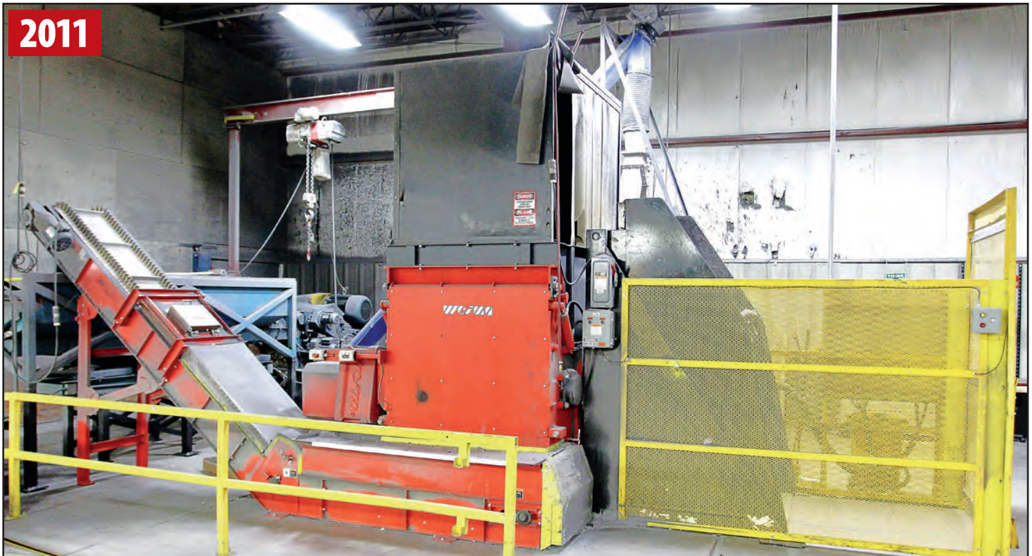
WEIMA WL-13 SINGLE SHAFT SHREDDER

View our current auction schedule at www.perfectionindustrial.com