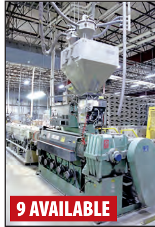
DAVIS STANDARD 35IN35 3.5" 24:1 EXTRUDER

PLEASE NOTE: EXTRUDER LINES WILL BE OFFERED AS COMPLETE LINES AND PIECE-MEAL. MOST LINES ARE COMPRISED OF (1) PRIMARY EXTRUDER W/TEMP PANEL, (1) CO-EXTRUDER W/TEMP PANEL, (1) CONAIR GRAVIMETRIC BLENDER, (1) CONAIR TCU, (1) CONAIR VACUUM SIZING TANK, ASSORTED HOT FOIL APPLICATORS, (1) CATERPULLER, (1) CUT OFF SAW. LINE CONFIGURATIONS VARY FROM LINE TO LINE, PLEASE SEE OUR CATALOG FOR SPECIFIC CONFIGURATIONS