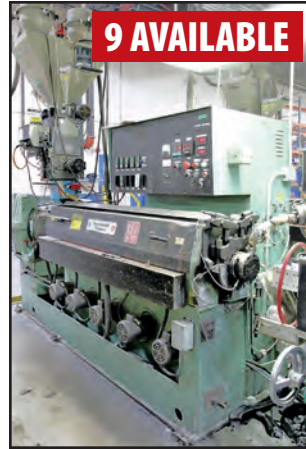
DAVIS STANDARD 35IN35 3.5" 24:1 EXTRUDER