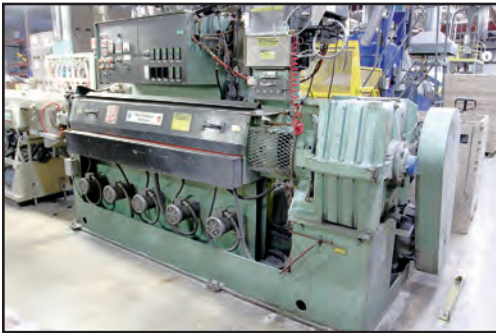
DAVIS STANDARD 35IN35 3.5" 24:1 EXTRUDER