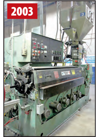
DAVIS STANDARD 35IN35 3.5" 24:1 EXTRUDER