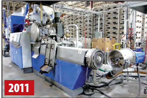
2011 EREMA 1108 TVE PLUS CUTTER COMPACTOR/EXTRUDER COMBINATION RECYCLING PLANT

Featuring: 2011 Erema PC 1108 TVE Plus Recycling System, 2011 Wiema WL-13 Primary Shredder w/Vecoplan 45/12/2/VU Secondary Shredder, (9) Davis Standard 3.5" 24:1 Extruders, (7) Davis Standard 2.5" 24:1 Extruders, (5) Davis Standard 1.5" Co-Extruders, (8) Davis Standard 1.25" Co-Extruders, Also Gravimetric Blenders, Vacuum Sizing Tanks, Hot Foil Applicators, Caterpullers, Saws, Chillers, Bulk Material Handling & Silos, 2014 Agie Charmilles Cut 20P Wire EDM & More