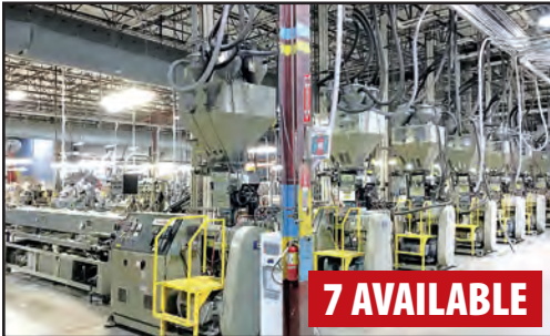
VIEW OF DAVIS STANDARD 2.5" EXTRUDERS