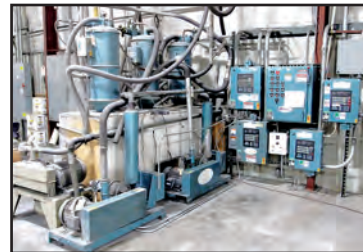
(5) UNA-DYN OMNI III PUSH/PULL VACUUM LOADERS

PLUS: LARGE SELECTION OF EXTRUDER PARTS, Etc.