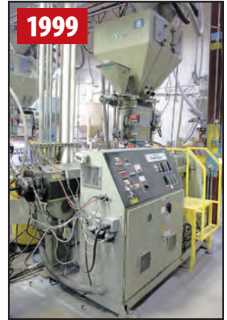
DAVIS STANDARD M-VI 25IN25 2.5" 24:1 EXTRUDER